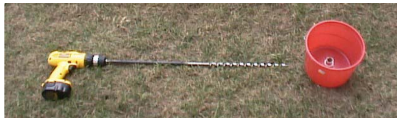
Figure 1. The sweatless soil sampler developed by the Soil, Water and Forage Analytical Laboratory at Oklahoma State University.

The Sweatless Soil Sampler (SSS, shown in Figure 1) reduces the amount of work and time needed to take a soil core. This makes it easier to take more cores per sample and gives you a composite sample that better represents your field. The SSS also makes it easier to mix your soil plugs in the bucket since they are already broken into small pieces.